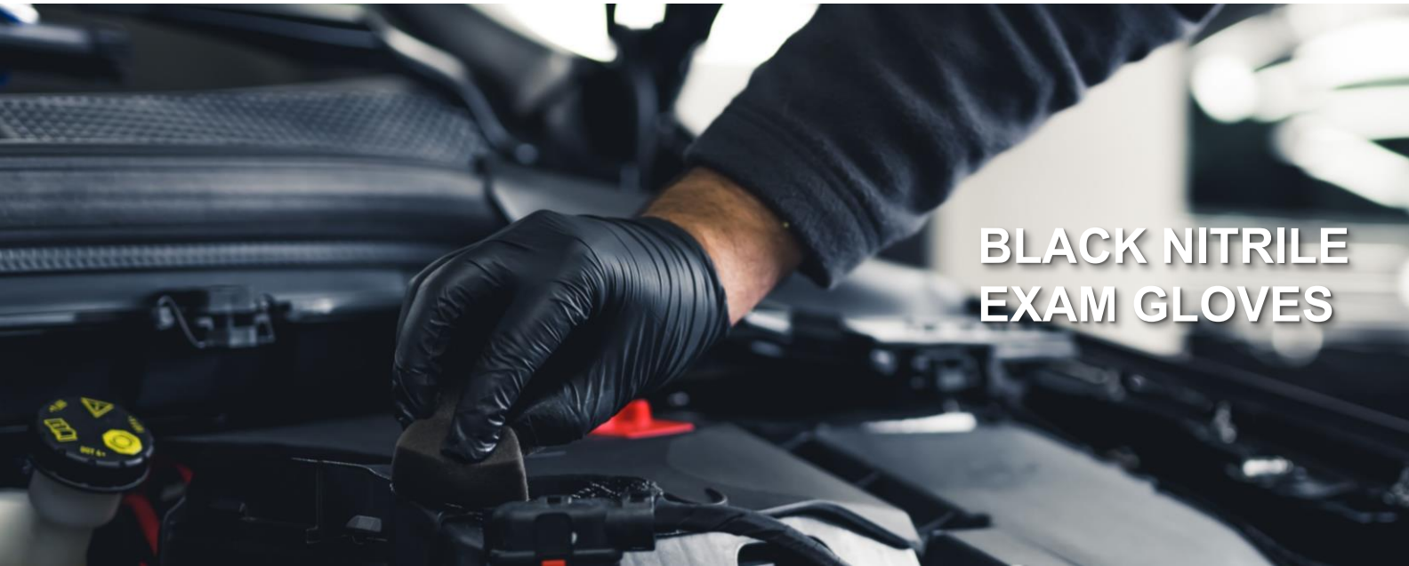
BLACK NITRILE EXAM GLOVES